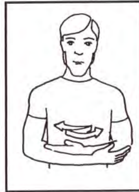
BABY - Make a cradle of the arms and move them as though rocking a baby. (Natural gesture)