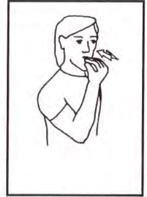
FOOD - Close dominant fingertips on to ball of thumb. Tap formation on chin, twice.