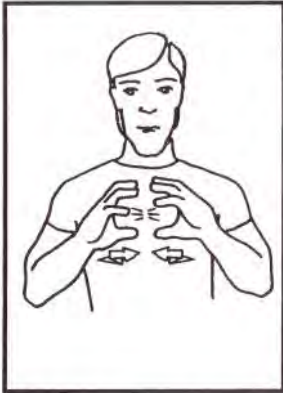
BALL (1) - Cup both hands fingers spread, bounce finger tips as if surrounding ball shape.