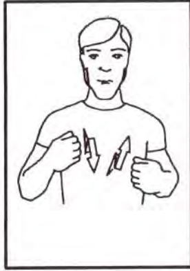
CAR - Clench both fists in front of body - move formation as if holding an imaginary steering wheel. (Natural gesture)