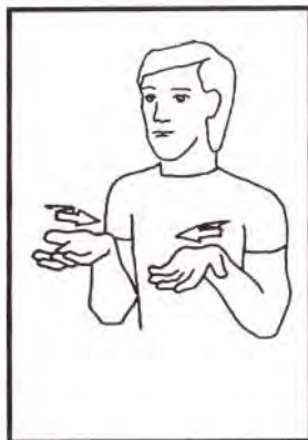
WHERE? - Open both hands and simultaneously move each hand from side to side, twice.