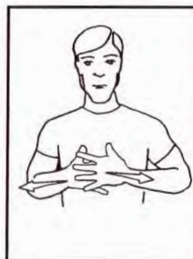
BIG - Place both open hands, palms facing body, fingers spread in front of body, one hand in front of other. Move hands out to either side in an arc.