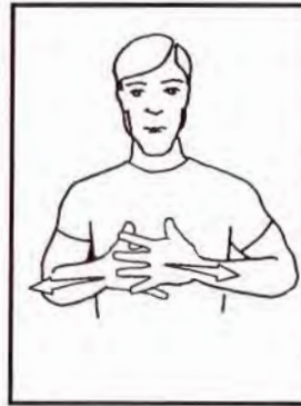
BIG - Place both open hands, palms facing body, fingers spread in front of body, one hand in front of other. Move hands out to either side in an arc.