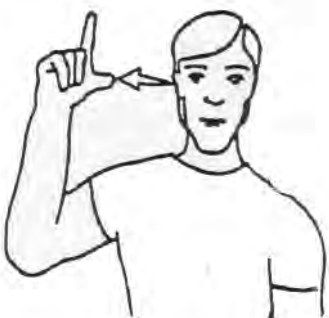
LOUD - Make L-shape with dominant index finger and thumb, level with head. Move formation away from head.