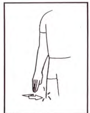
DOG - Hit thigh with open dominant hand, twice.