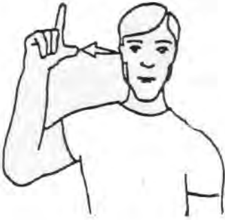
LOUD - Make L-shape with dominant index finger and thumb, level with head. Move formation away from head.