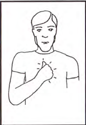
MY/MINE - Place dominant fist on chest, palm in.