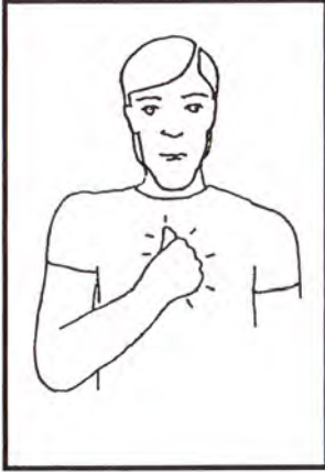
MY/MINE - Place dominant fist on chest, palm in.