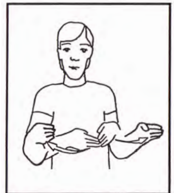
OPEN - Open both hands, palms facing body and fingertips touching. Move hands apart to finish with fingers pointing away from body.