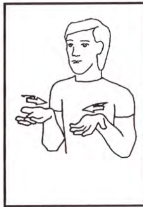
WHERE? - Open both hands and simultaneously move each hand from side to side, twice.